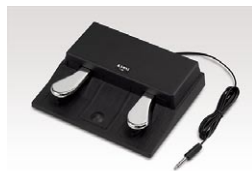
F-20 damper/soft pedal