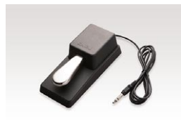
F-10H damper pedal