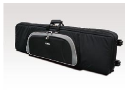
Gig-bag with castors