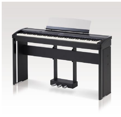
HM-4 designer stand, F-301 triple pedal (sold separately)

Specifications are subject to change without notice.